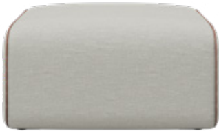
SOLARIS MODULAR SOFA - STOOL

L 79 x W 58 x H 40 cm | L 33" x W 23" x H 15 1/2"