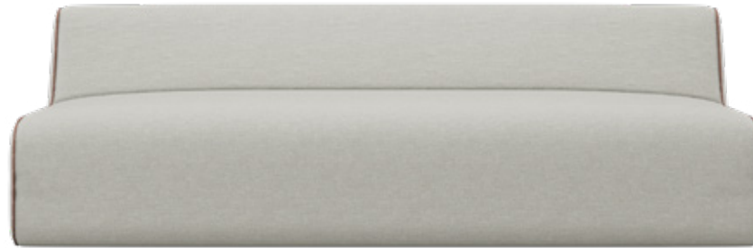
SOLARIS MODULAR SOFA - 3 SEATER

L 237 x W 85 x H 70 cm | L 93 1/2" x W 31 1/2" x H 27 1/2"