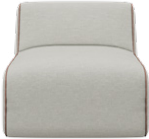
SOLARIS MODULAR SOFA - 1 SEATER

L 79 x W 85 x H 70 cm | L 31" x W 31 1/2" x H 27 1/2"