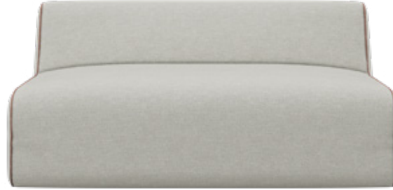
SOLARIS MODULAR SOFA - 2 SEATER

L 158 x W 85 x H 70 cm | L 62" x W 31 1/2" x H 27 1/2"